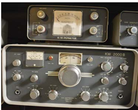
The most popular transceiver of all, the KW2000B, with the very rare 2 tone SSB PEP meter.

Daytime SSB activity centres will be on 7.177 or 3.777MHz and 14.277MHz (KW77) as conditions permit. Operators are encouraged to use KW gear on other bands, so if you hear some AM on 1.977 or MCW operating on 160 or 80 metres at night, don't be surprised. AM/ CW activity will be on the VMARS net channels (see www.vmars.org.uk ).